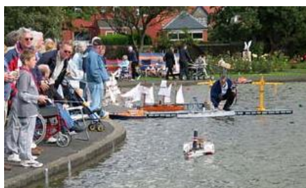
North promenade - pier, RNLB lifeboat station, putting green, model boating pond