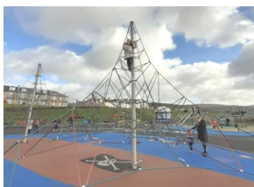
South promenade - skatepark, kiddies playpark, putting green